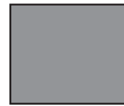
Posterboard: 300 x 250 pixels